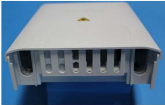
Symmetric PBPO NG with external anchoring